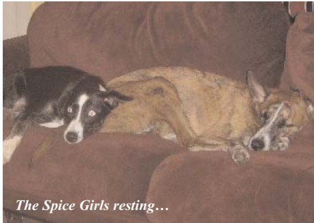
The Spice Girls resting...