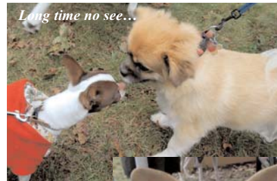
Long time no see...